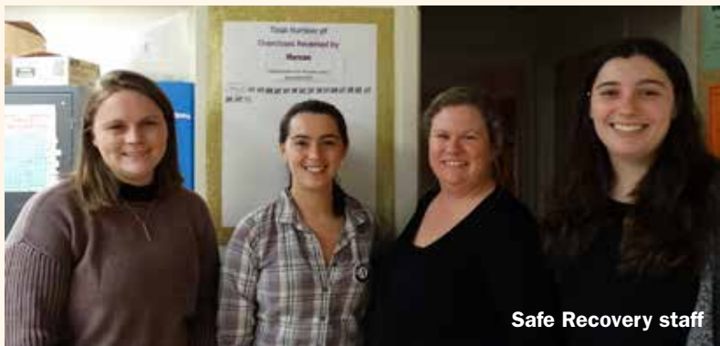
Safe Recovery staff

Individuals trained to administer Naloxone