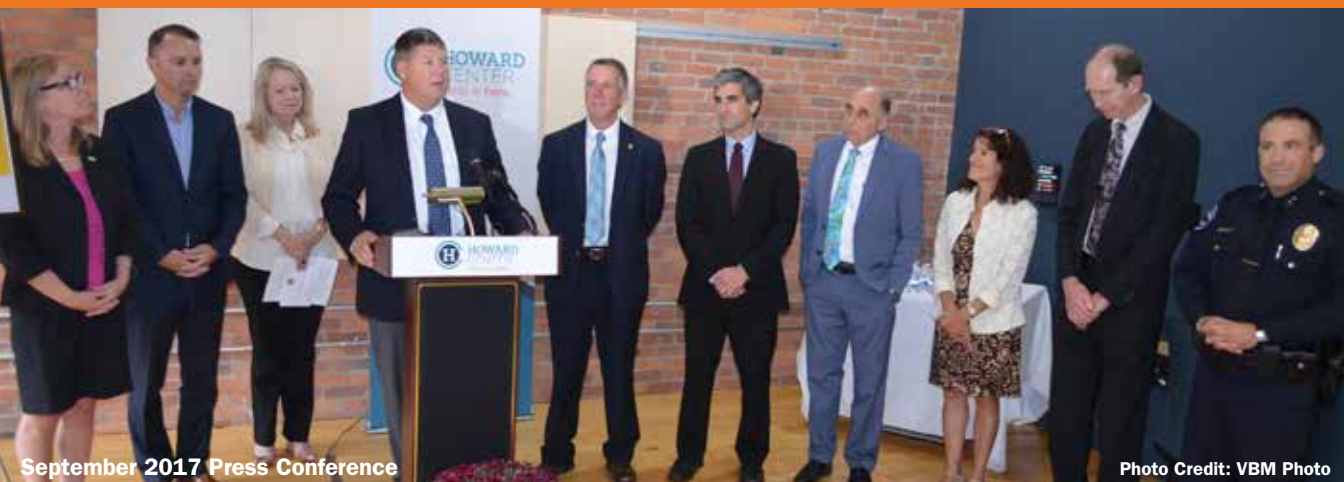
September 2017 Press Conference