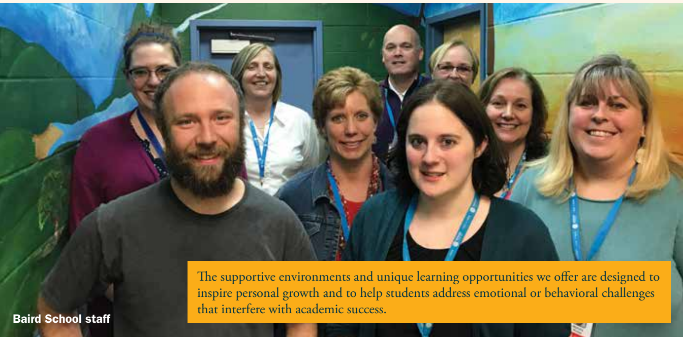
Baird School staff

The supportive environments and unique learning opportunities we offer are designed to inspire personal growth and to help students address emotional or behavioral challenges that interfere with academic success.