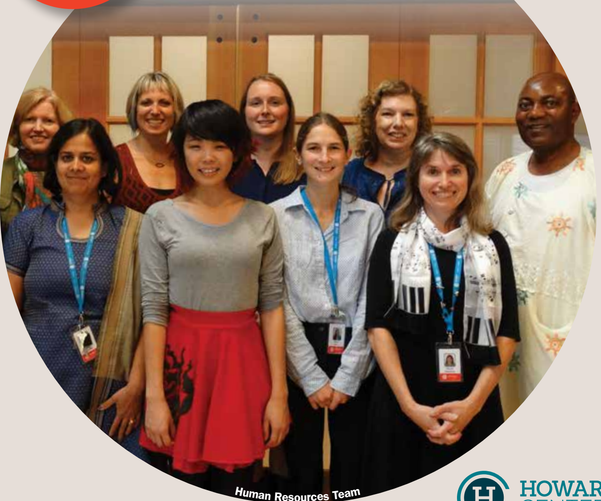
Human Resources Team

Welcome Bienvenue ترحيب Bienvenidos Sudhowaada Dobrodošli 欢迎 Karibu Hân Hoan Đón Chào स्वागतम् ཐེགས་པར་དགའ་བཟུ་བྱ། မင်္ဂလာ