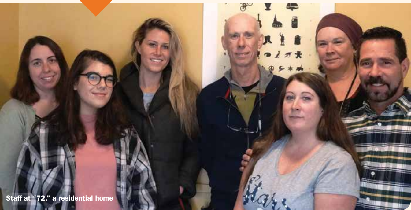
Staff at “72,” a residential home